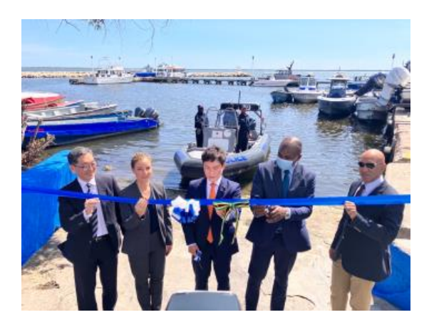
Handing Over Ceremony

On October 5,2022, Mr. AKIMOTO Masatoshi, Parliamentary Vice-Minister for Foreign Affairs of Japan, attended a handing over ceremony at the Marine Police Headquarters in Newport, East Kingston. In attendance were Parliamentary Vice-Minister Akimoto and Ambassador Fujiwara as Japanese representatives, Senator the Honourable Kamina Johnson Smith, Minister of Foreign Affairs and Foreign Trade of; Major General Antony Anderson, CD, JP Commissioner of Police, Jamaica Constabulary Force and The Hon. Zavia Mayne, MP Minister of State, Ministry of National Security as Jamaican representatives.