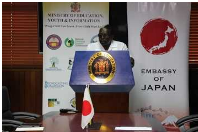
Greetings from The Speaker of the House of Representatives, Hon. Parnell Charles