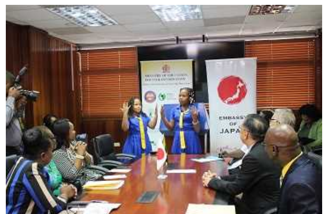
Showing Appreciation by poetry from the children, Richmond Park Primary School