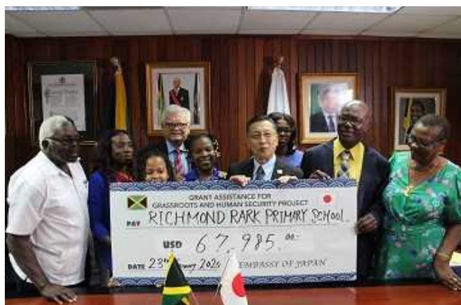
Officials, Stakeholders, Teachers and children from the school in attendance