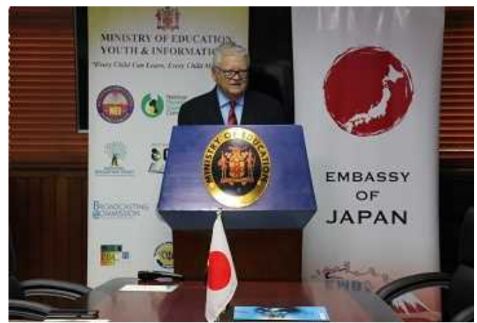
Remarks from The Minister of Education, Youth and Information Hon. Karl Samuda