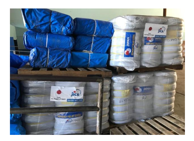
Some of the emergency relief goods donated by the people and Government of Japan for persons affected by Hurricane Dorian that occurred September 1 - 3, 2019 in The Bahamas.