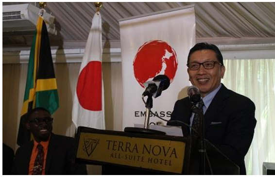
Keynote address by Ambassador Yamazaki