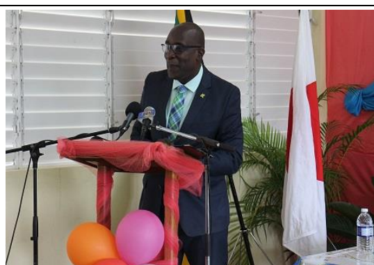
Keynote address from Minister, the Honourable Ruel Reid