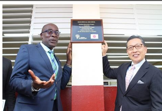
Minister and Ambassador unveiled the plaque