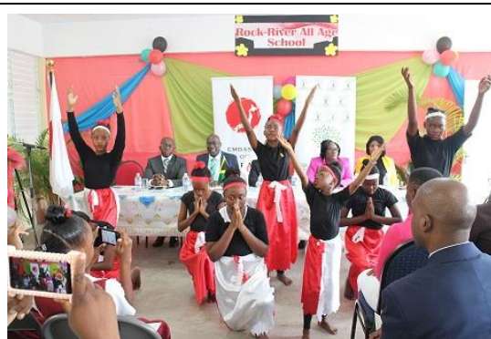
Showing Appreciation by dance from the students, Rock River Primary School