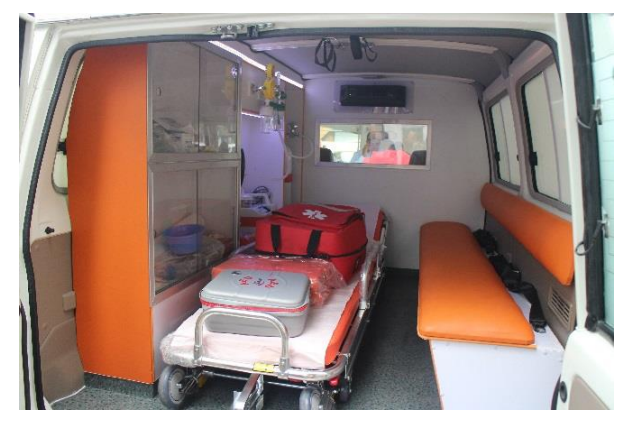
Ambulance outfitted with medical equipment to treat the cardiovascular patients