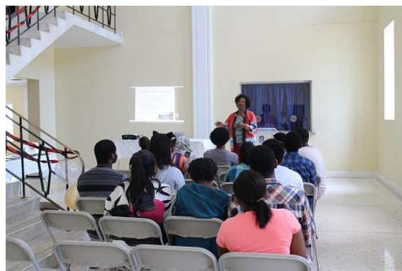
(left) Experienceing Japanese Traditional Clothing, Yukata