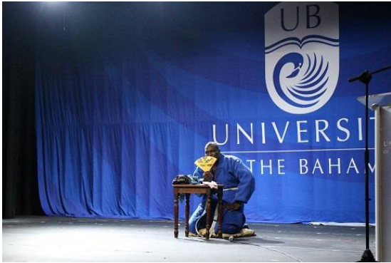
(left) Storytelling of a Bahamian story in Japanese Rakugo style