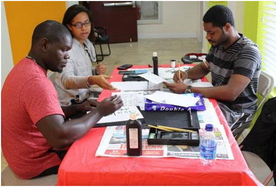
(left) Japanese calligraphy