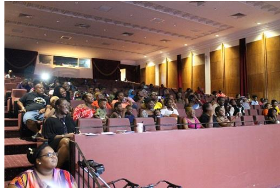
(right) Excited audience to view the performance