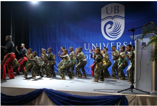
(left) Children performing Karate