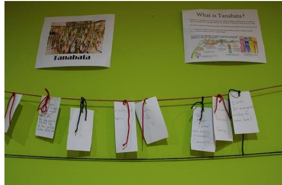
(right) Imitation of a custom of Tanabata (Japanese festival in July)