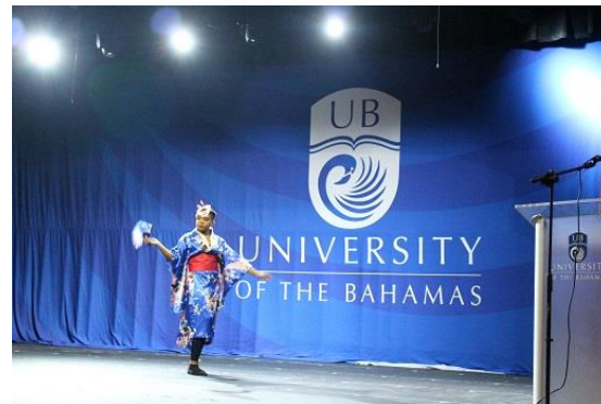
(right) Dance inspired by Japanese Geisha performance