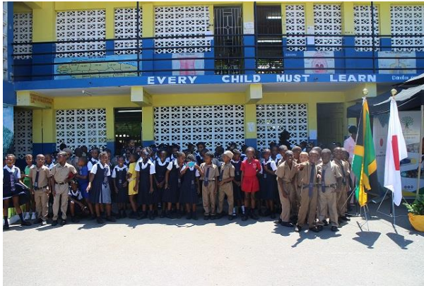
Participated by many students