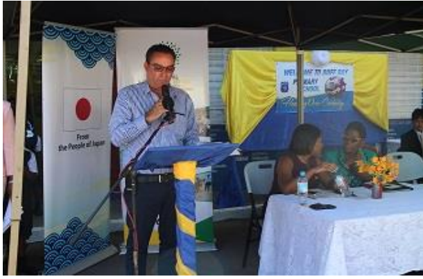
Hon. Daryl Vaz expressed his gratitude