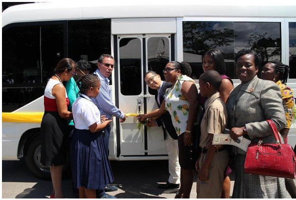
Ribbon cutting to reveal the bus