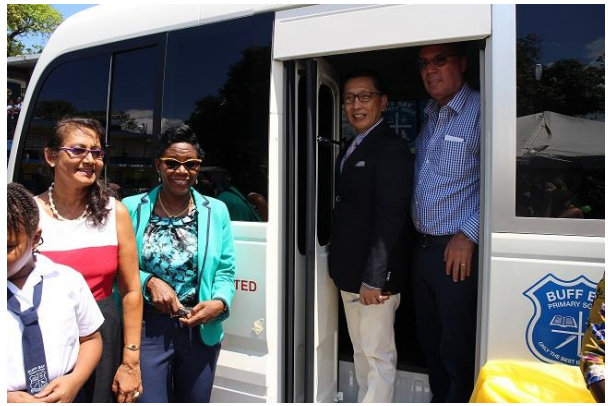
Minister and Ambassador ride the bus