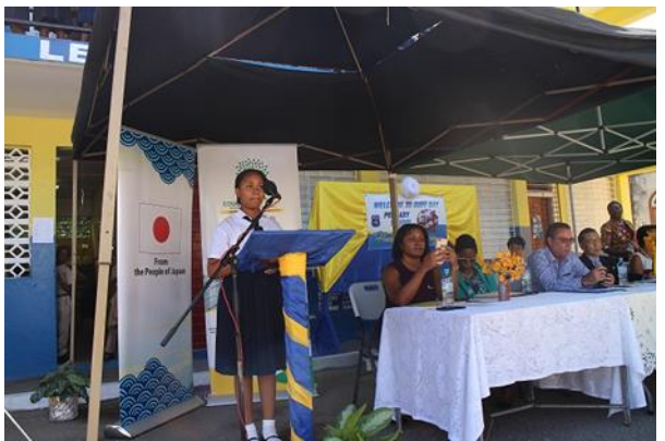
Song of appreciation from students