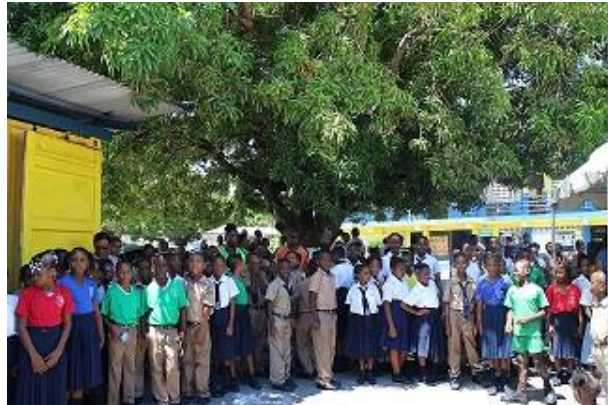
Showing their appreciation by singing