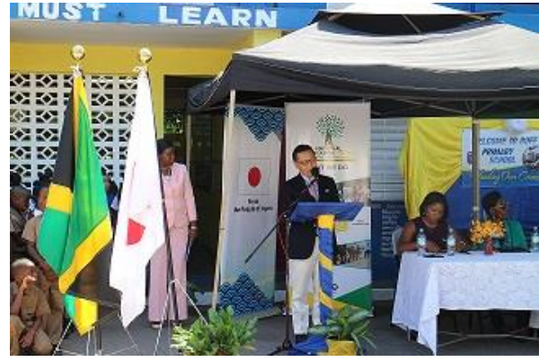
Ambassador delivering his remarks