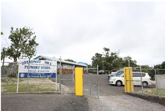
Installed Fence and paved ground