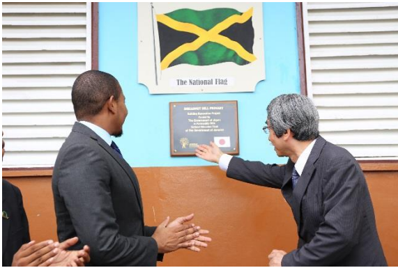
The Hon. Green and Ambassador unveiling the plaque