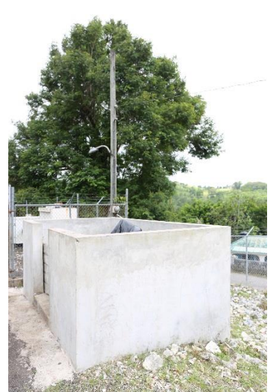
Installed Gabbage receptacle