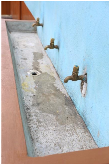
Renovated drinking fountain