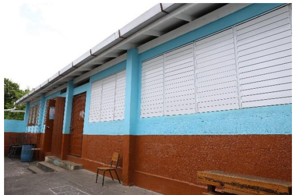
Renovated class room block