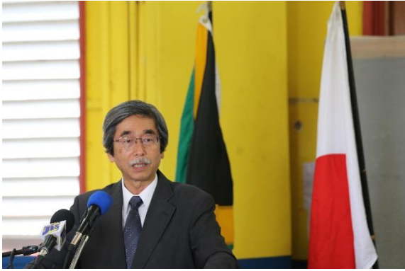
Ambassador delivering his remarks

in a main class room. The school ground was asphalted, and a perimeter fence was constructed to ensure the safety and security of the school environment.