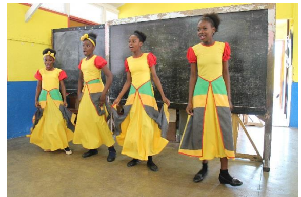
Poem of appreciation from the students