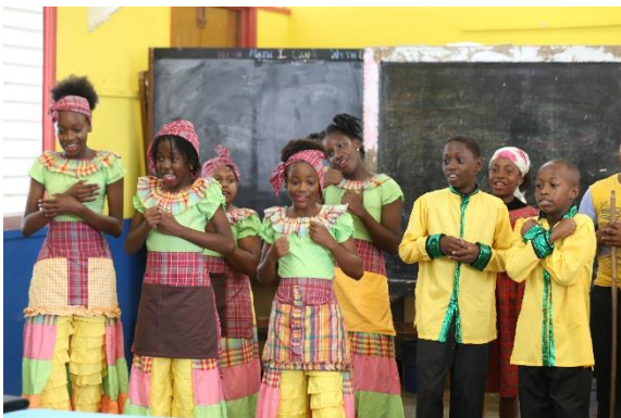
Students playing in a drama