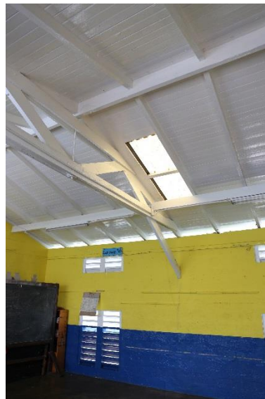
Installed new ceiling