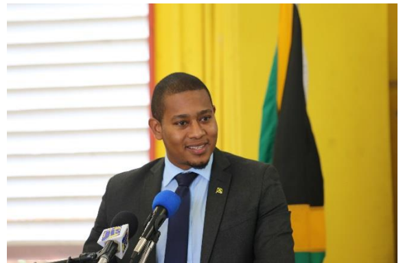
Keynote address from the Hon. Floyd Green