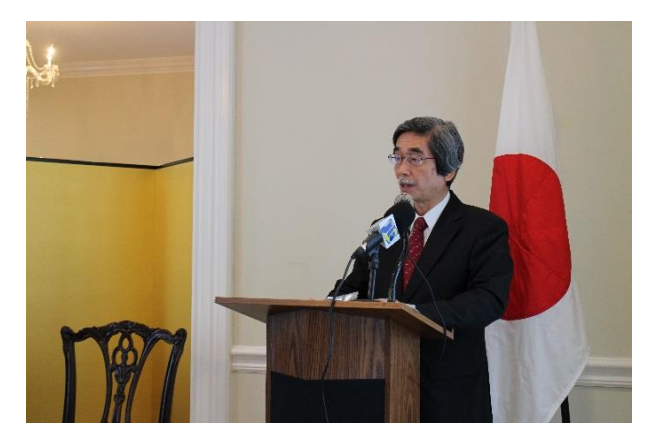
(right) Remarks from Hon. Floyd Green, State Minister in the Ministry of Education, Youth and Information