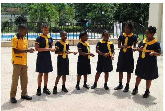
(left) Handing over of the cheque to Epworth Primary School (right) Song of appreciation from Epworth Primary School