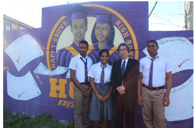
Ambassador with the students of Happy Grove High School