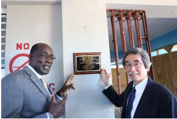
Handing over of the donated building