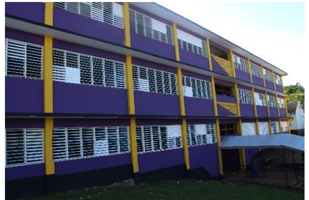
Renovated building/Block C