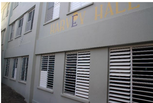
Renovated building/Harvey Hall